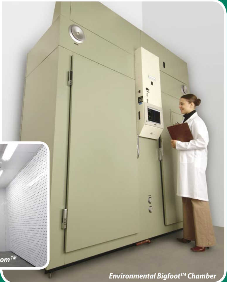
Environmental Bigfoot™ Chamber